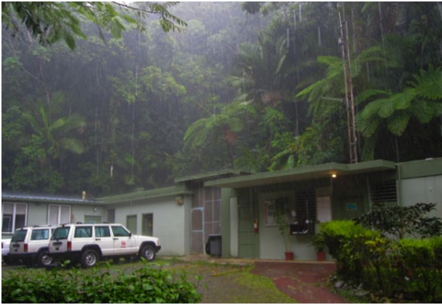
El Verde Field Station, El Yunque National Forest, Puerto Rico.

Moreover, average temperatures have increased in the urbanized regions around the forest and may be changing in the forest itself. A clear understanding of the effects of these events is critical to our ability to forecast future changes in species diversity, ecosystem structure and, ultimately, the ability of the forest to provide ecosystem services to the growing human population of eastern Puerto Rico.