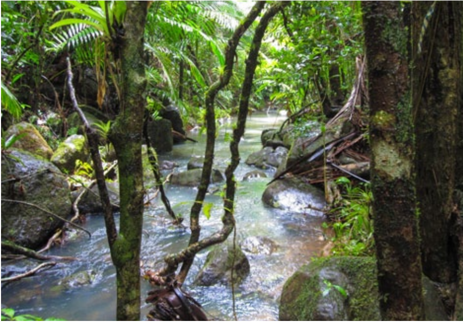
Stream running through El Yunque.

regime will change in coming decades. Debate continues about whether increasing ocean surface temperatures will lead to increased frequency of intense hurricanes, but it is well established that average air temperatures are increasing in northeastern Puerto Rico, driven both by global warming trends and rapid urbanization, and that average annual precipitation is declining. Although gastropod populations seem remarkably resilient towards cyclical natural disturbances, it remains to be seen how they might be affected