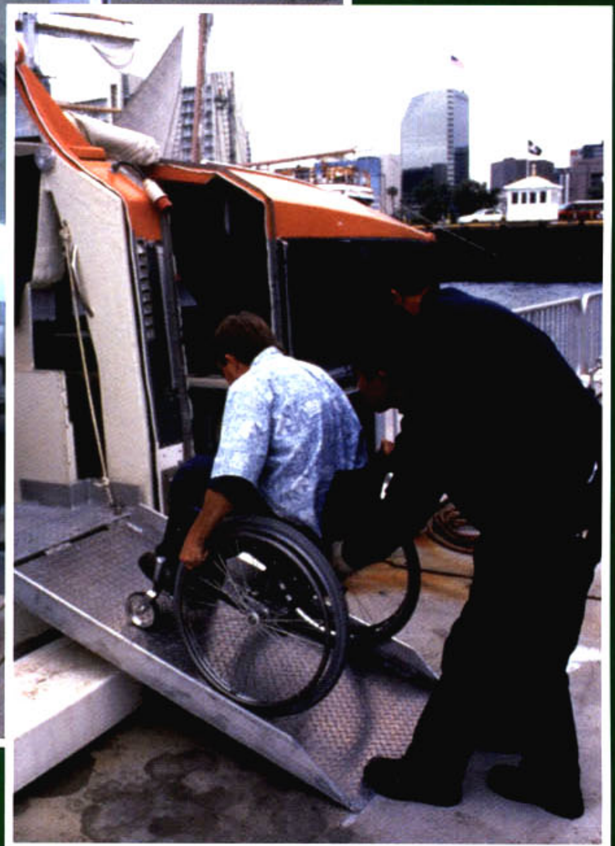
Wheelchair-accessible tender-transfer system

Cruise ship vacations have become the fastest-growing segment of the travel industry. According to Cruise Line International Association, the cruise ship industry reports deploying 158 ships to North America annually, with an economic impact of $15.5 billion. More than 10 million individuals embarked on ocean voyages last year, with U.S. residents accounting for three out of every four passengers ( The Christian Science Monitor , February 28, 2005).