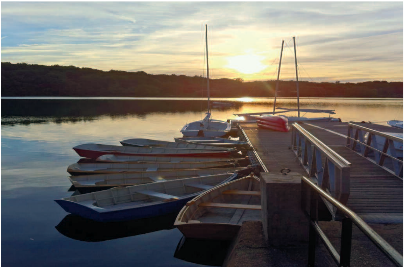
Jamaica Pond at dusk, July 2011.