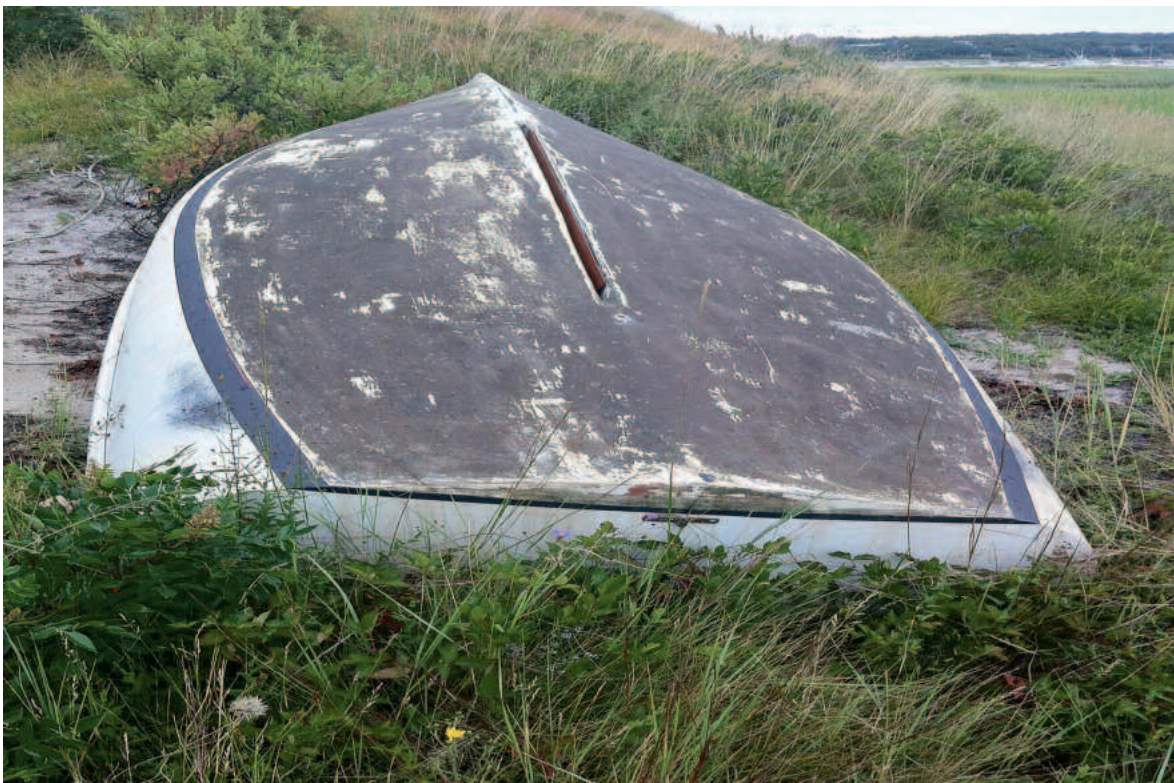
Cape Cod, Truro, August 2011.

In truth, I know so little about my mother. She was an intensely private person and anything I do know about her I know from stories other people, mostly her sisters, have told me. So, not to put too fine a point on it, I learned a great deal about my mother by watching this television show. Or I made up a great deal about her. But either way, it’s what I’ve got to work with. I would have liked to have checked my facts with her.