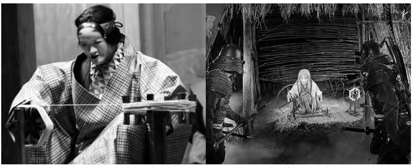
Figure 7. A demonic woman in the Noh play Kurozuka (Black Mound).

In the Noh play Black Mound, the mistress warns the monks not to look into her bedroom when she leaves them to collect firewood to keep them warm, but one of the monks is unable to restrain his curiosity. Peeping into her room, he finds a pile of skeletons. Realizing that they are in the house of a demon, the monks flee hurriedly. Appearing as an angry demon, the mistress chases them down until she is finally