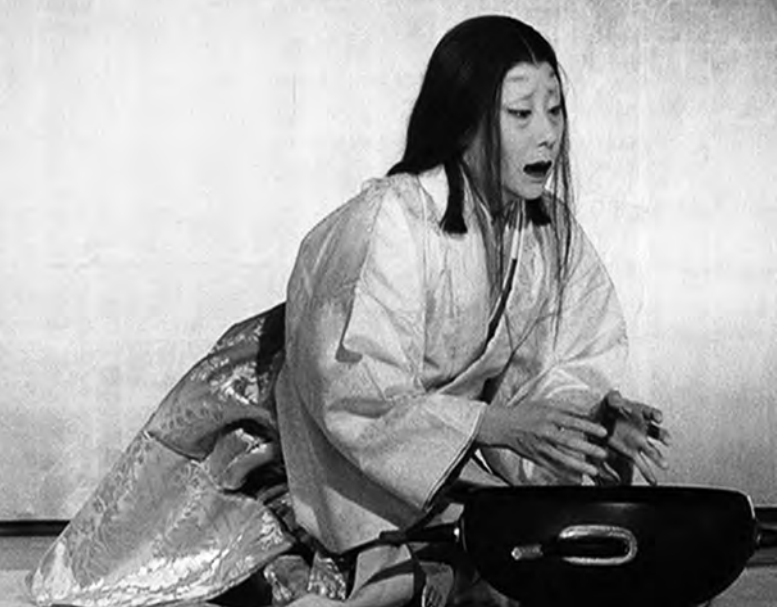
Figure 4. Asaji's sorrow. (Throne of Blood, ©1957 Toho Company)

indicates the Noh elements are mostly associated with Asaji, for "she is the most limited, the most confined, the most driven, the most evil." Similarly, film scholar Keiko McDonald, in Japanese Classical Theater in Films , claims that in some scenes, "while Washizu's features convey expressions of horror and dismay, her [Asaji's] face is a study in absolute control: static, cold, and impassive, like a female blank Noh mask." 8