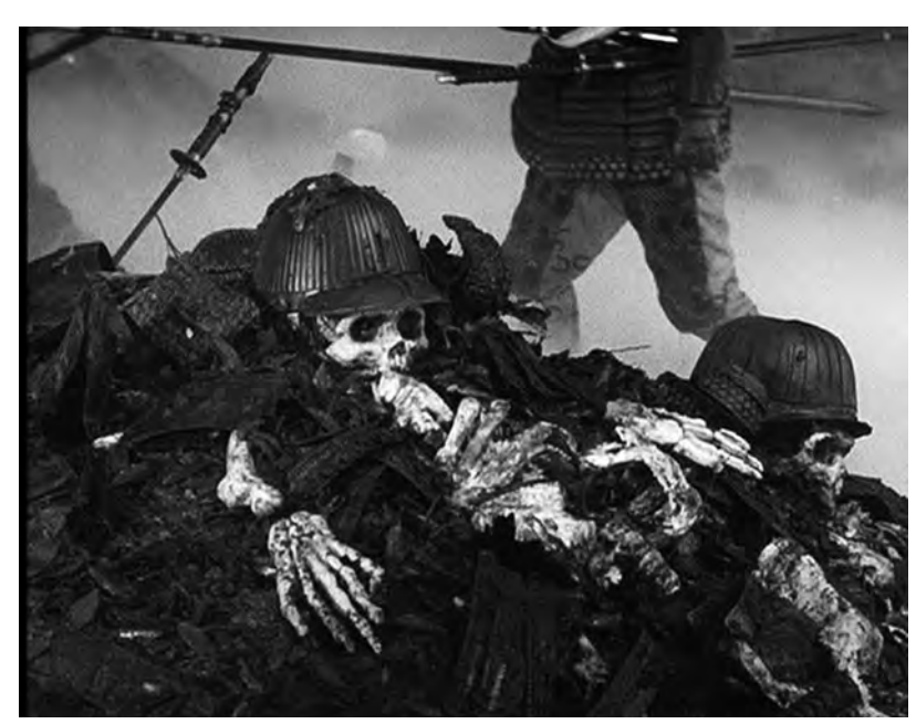
Figure 9. A pile of skeletons in Throne of Blood . ( Throne of Blood , ©1957 Toho Company)

overcome by the power of the monks' prayers. In the film, Washizu and Miki (Banquo) pass mounds of unburied human skeletons, reminiscent of the Noh play. This scene effectively presents the multiple dimensions of the film. For those familiar with the Noh play Black Mound, it indicates human weakness and falling into temptation. The irony of this play is that the ascetic monks who are practicing the severe service of self-discipline and abstention cannot restrain their curiosity. Their lack of self-discipline ignites the anger of the demonic woman, who attempted to offer some help by providing them with shelter and warmth. For those who see the horrifying scene as it is, this scene signifies the futility of the human ego, which can drive people to kill each other. There are no brutal murder scenes in the film; instead, Kurosawa makes the best use of the invisible by allowing the imagination of the audience its full play, which is the fundamental principle of Japanese Noh theater.