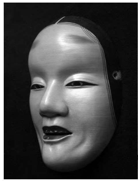
Figure 3. A fukai mask is expressive of the sorrow of the woman who has lost her child.

In The Films of Akira Kurosawa , well-known American film critic Donald Richie argues that another reason for using Noh in this film is that Kurosawa was interested in the limitations of character, that is, "the Noh offered the clearest visual indication of these limitations." As Richie points out, there are certain "limitations" that one can express using stylized movements and masks of Noh. These visibly imposed "limitations" are indeed effective at expressing restrained or suppressed emotions on the Noh stage. Richie