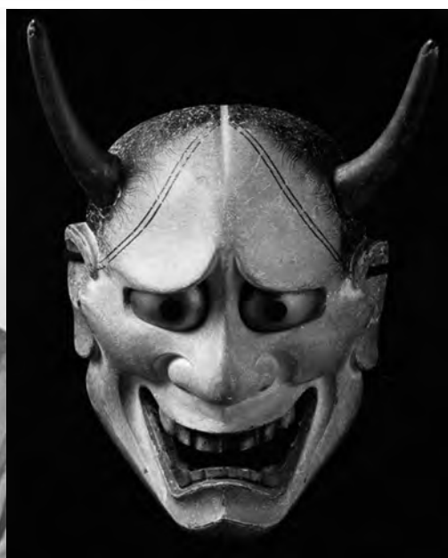
Figure 6. A hannya mask.

kind of traumatic event that triggers the mental disequilibrium. The majority of these plays feature a mother's affection for her child and her suffering when parted from that child. The madness is expressed in a subtle yet intense manner. Such restrained madness often conveys the agony, suffering, and despair of the female protagonist. Figure 5 is one of the most often-discussed scenes where Noh elements express madness. Strongly indicating derangement, Asaji's dramatic expression resembles that of a demonic woman wearing hannya or ja masks. Her expression of madness reveals profound sadness, derived from the vanity of willful desires.