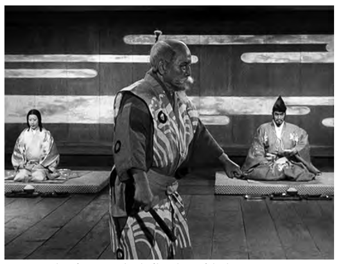
Figure 1. A Noh performance within the film. (Throne of Blood, @1957 Toho Company)