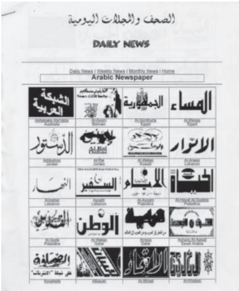
Page from an Arabic Newspaper.

Governments of the Middle Eastern countries are aware of the importance of the media and the free flow of information. However, there still are some concerns that too much press freedom might compromise or undermine the power of the rulers. Officials could not critique media policies while in power. Khalid Al-Ajmi, the former minister of information in Kuwait voiced his dissatisfaction with the existing media and communication policies after he left his position. A number of other officials do the same, which is a good sign that a movement of reform is in progress.