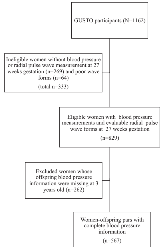
FIGURE 1. Flow chart of women in the Growing Up in Singapore Towards healthy Outcomes (GUSTO) study selected for analysis.

Based on a standardized protocol, maternal blood pressures were taken by trained research coordinators who were blinded to the maternal status of preeclampsia or gestational hypertension during the GUSTO mid-pregnancy follow-up visits at a median gestation of 27 weeks (interquartile range 26–29 weeks). Mothers were rested for at least 10 minutes prior to blood pressure measurement, and the peripheral SBP and DBP were measured thrice from the brachial artery at 30 to 60 second intervals with an oscillometric device (MC3100,