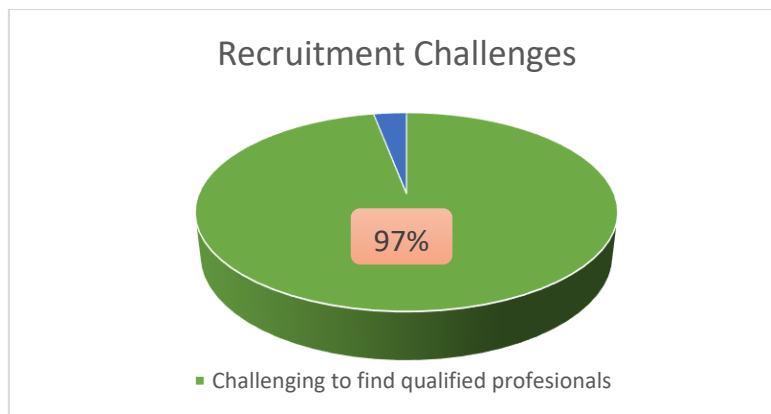
Figure 1. Recruitment Challenges