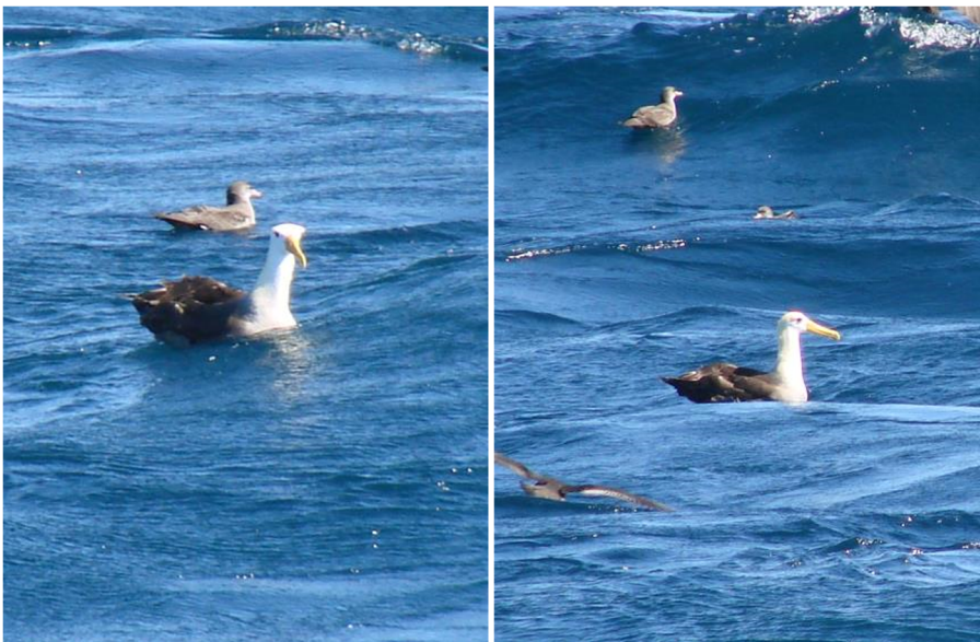
Annex 2. An adult waved albatross associated with Pink-footed shearwaters attending a trawl vessel for South Pacific hake during December 2011, north of the Isla Mocha, Chile / Adulto de albatros de Galápagos asociado con fardelas blancas asistiendo en un barco de arrastre para Merluza común durante diciembre 2011, al norte de Isla Mocha, Chile.