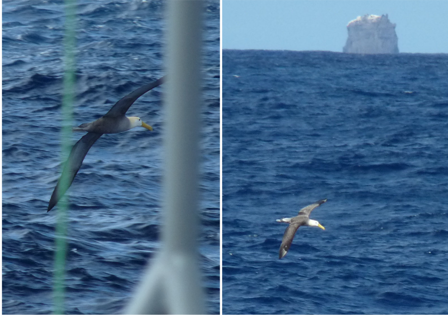
Annex 1. An adult waved albatross recorded following a swordfish longline vessel in August 2010 near to Islas Desventuradas, Chile / Adulto de albatros de Galápagos registrado siguiendo un barco de pesca de palangre pelágico para pez espada en agosto 2010, cerca de Islas Desventuradas, Chile