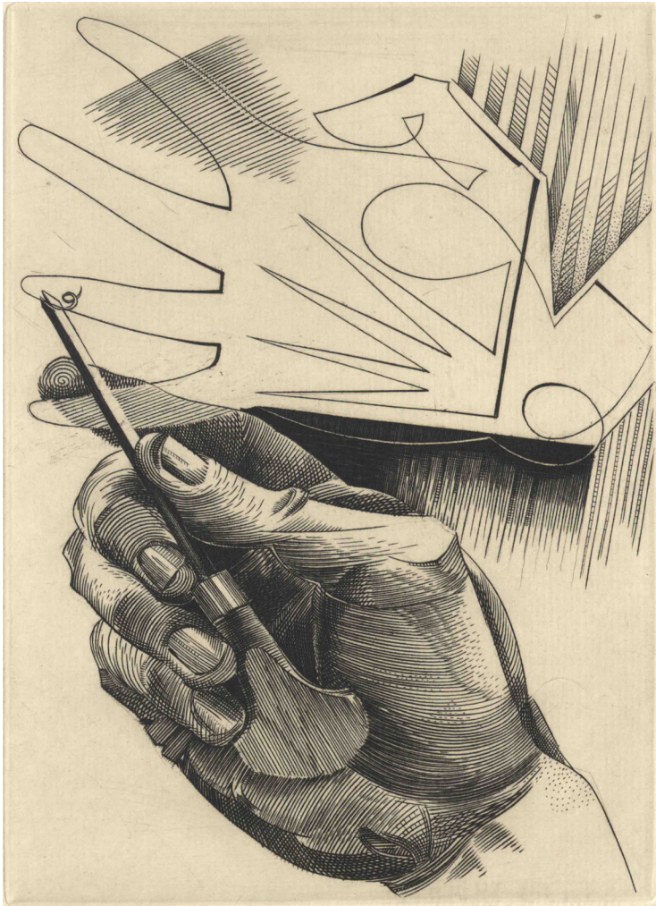
Bachelard et al, 1949: Fig. 7 in source.