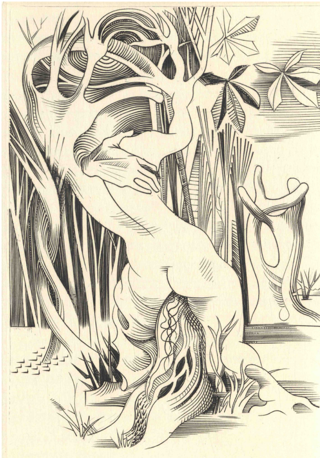
Bachelard & Flocon 1950: Fig. 5 in source.

But it is not only vegetable and human forms that continually intertwine. Another characteristic feature of this engraving is that forms perpetually grow out of interstices and that figurations are transformed into interstices again.