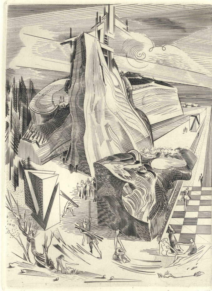
Plate “Le nid d’aigle” (Bachelard &amp; Flocon, 1957: Fig. 5 in source).

In view of these comments, it will hardly be surprising to find that in Le rationalisme appliqué — one of his epistemological works of the second series, around 1950 — Bachelard not only attributes an “abstract-concrete mentality” to the physics of his era, but also describes his own philosophy concerned with that mentality as a “philosophy at work” or “philosophy of work” ( philosophie au travail ), as opposed to what he dismissively calls the “philosophies of synopsis” ( philosophies de résumé ) of his predecessors and contemporaries. (Bachelard, 1949: 1, 9). And Bachelard sees Flocon’s incisions with the burin as “a symbol of the rock drill penetrating the resistant depths. From the moment of its very first, sketchy movement against a hard