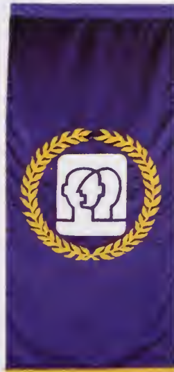
School of Audiology and Speech-Language Pathology