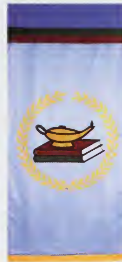
College of Education