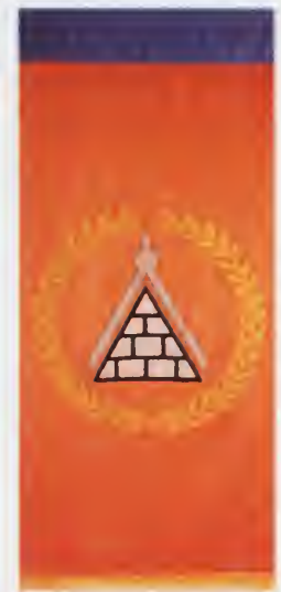
Herff College of Engineering