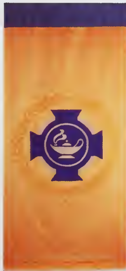
Loewenberg School of Nursing