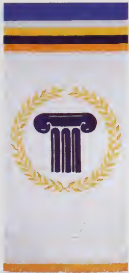
College of Arts and Sciences