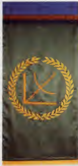
Fogelman College of Business and Economics