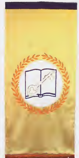
Ned R. McWherter Library