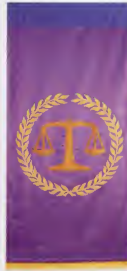
Cecil C. Humphreys School of Law