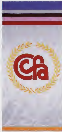
College of Communication and Fine Arts