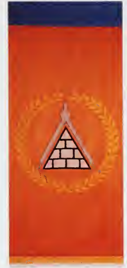
Herff College of Engineering