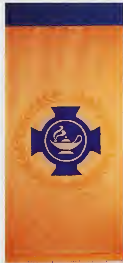
Loewenberg School of Nursing