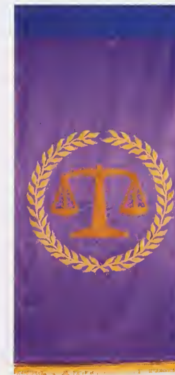
Cecil C. Humphreys School of Law