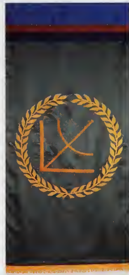
Fogelman College of Business and Economics