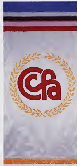
College of Communication and Fine Arts