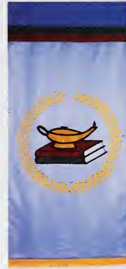
College of Education