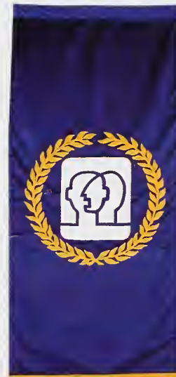
School of Audiology and Speech-Language Pathology