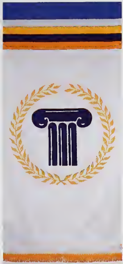
College of Arts and Sciences