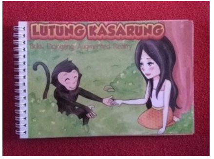
Figure 2. The Lutung Kasarung Storybook

In addition, with the AR Book, it is also