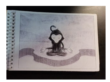
Figure 3. Book Drawing Pages