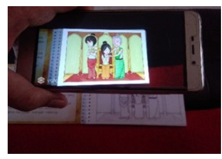
Figure 5. Display of Augmented Reality on Smartphone