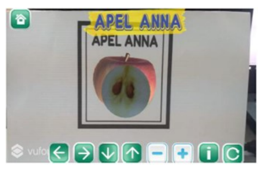
Figure 1. Augmented Reality

qualitative. The data was collected using observation and interview techniques. So this study concluded that the use of picture storybooks can greatly improve the language skills of children depending on the type of book given to children.