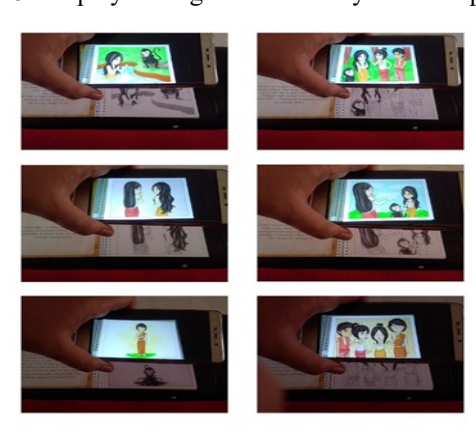
Figure 6. Collection of Augmented Reality Views