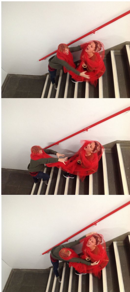
Fig 3: Beowulf vs. Grendela (sequence of three photographs) [Colour figure can be viewed at wileyonlinelibrary.com ]

by the narrowness of the stairwell, tending to position herself above or below the action.