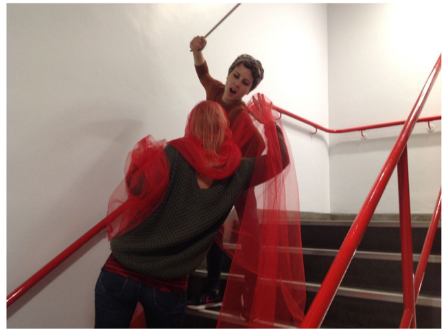
Fig 2: Beowulf vs. Grendela, Grendela attacks (photograph) [Colour figure can be viewed at wileyonlinelibrary.com ]

In considering how the students interpret the role of Grendel's Mother, we are prompted to return to the question that we asked – what aspects of her body suggest gender? Or, what aspects of her gendered body suggest monstrosity? The focus on dramatic action (the fight) shifts this locus of attention from her body to the ways that she engages in combat. We suggest that through the process of making these short films, there is some form of “contestation, a struggle for meaning and a struggle for control of the way that the body is placed into its context and the way that it is read” (Conroy, 2010, p. 73). In analysing what happens as the students knit their images together into a