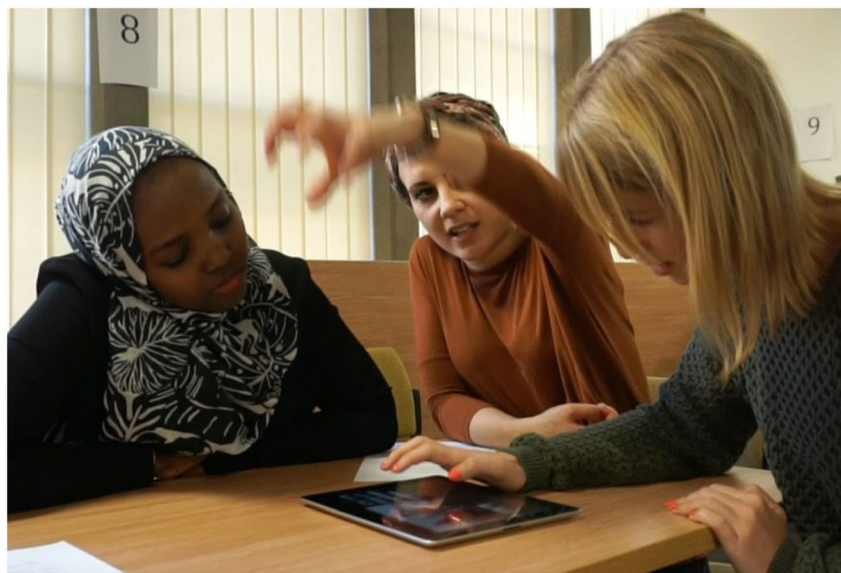
Fig 4: Sophie mirrors Hope's claw action, as the Beowulf vs. Grendela film-makers edit (still) [Colour figure can be viewed at wileyonlinelibrary.com ]

For Sumaya, wielding the camera and editing offer her roles that bring her closer to the expressive action,