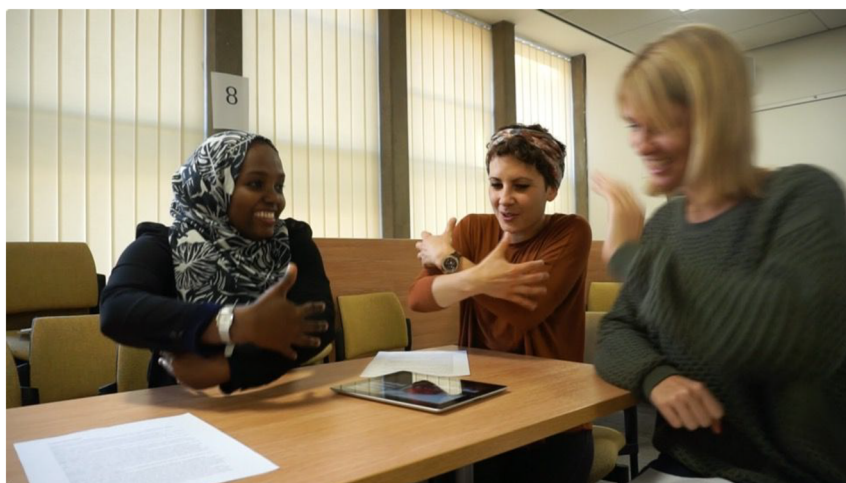
Fig 5: Cocooning as the Beowulf vs. Grendela film-makers' edit (still) [Colour figure can be viewed at wileyonlinelibrary.com ]