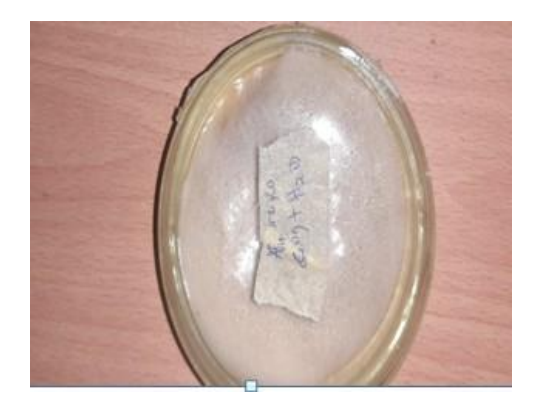
Plate 3: Pure Culture of Fungus Isolated from Pepper on Potatoes Dextrose Agar

Isolation of Fungi Associated with Capsicum chinense Jacq : The result of the fungal isolation is presented in plate 3.1. one unidentified fungal organisms HP- 02 was isolated and found to be associated with Habanero pepper ( Capsicum chinense Jacq.) (Plate 2).