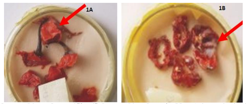
Plate 1A: Pepper on Blotter Paper and Plate 1B: Pepper on Blotter Paper after 7 Days (red arrow showing the fungus)

Petri-dishes were lined with 3 layers of sterilized 9cm Whatman's filter paper, the filter paper was soaked with little water and then the petri dishes were covered immediately. The pepper was surface sterilized in a beaker using 70% ethanol for 2-3minutes, discard the ethanol and rinsed with sterile distilled water twice. 4-5 pepper fruits were plated per Petri-dish (Plate 1a), the plates were then wrapped with masking tape and then labelled. Plated pepper was incubated at 25 + 2^{\circ} C in the laboratory for 7 days. Unidentified fungus (Plate 1b), was sub-cultured on Potato Dextrose Agar (PDA) medium under darkness at room temperature (25+ 2^{\circ} C).