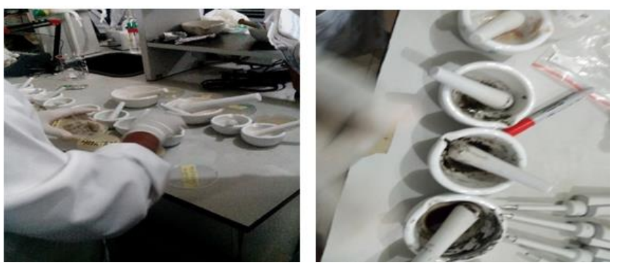
Plate 2a: Preparing cultures for crushing and Plate 2b: Crushed cultures

7.0.26 software, and aligned using the Basic Local Alignment Search Tool for nucleotide (BLASTN) of the National Center for Biotechnology Information (NCBI) database.