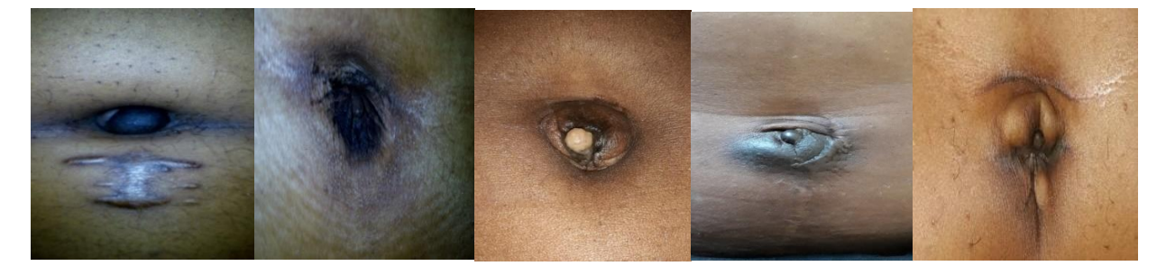
Figure 1: Preoperative umbilical images of all the patients

Umbilical endometriosis, omphalectomy, laparoscopic management