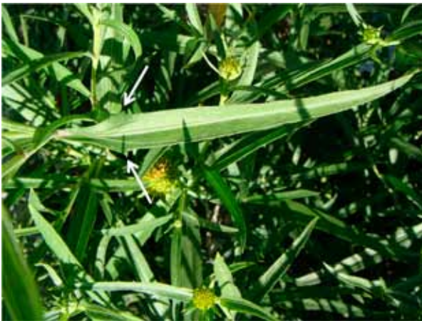
Figure 1. Leaves of Wedelia glauca . Basal teeth are shown with arrows.

Sometimes, it is possible to find fragments of plants in the rumen content 21 . The dermis of the plants does not undergo significant changes in spite of the mechanic and enzymatic activity occurring in the rumen. This allows the identification of such structures by means of optical microscopy, a method known as micrography or micrographic analysis.