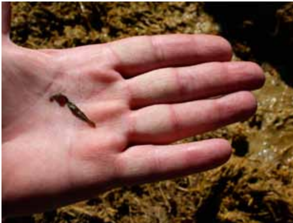
Figure 3. Plant material found in the ruminal content of the bull.

gested were found (Figure 3). Other findings included petechial hemorrhages in epicardium and endocardium and congestion of the lungs; all other organs appeared normal. The pH in the rumen content was 6 and tests for the determination of cyanhydric acid and nitrites or nitrates were negative.