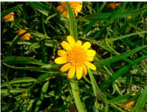
Figure 2. Inflorescence of Wedelia glauca .

The macroscopic and microscopic anatomopathologic findings of an accidental poisoning case with Wg confirmed by micrographic analysis of plant parts found in the rumen contents and the bales used to feed animals are presented in this paper.