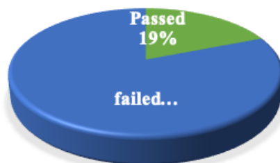
Figure 1. Diagnostic test (pre-test).

From the fraction measured, only 19% of students passed the test with a grade between 3.0 and 3.9 (out of 5.0) compared to 81% who did not pass the pre-test (grades below 2.9 out of 5.0) (Figure 1).