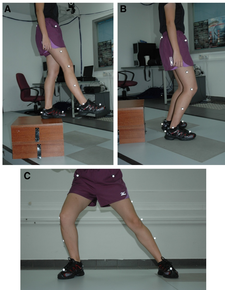
Figure 2 The different dynamic exercises tested in this experiment (A, B) drop-landing, (C) lateral hopping.

In this study, there were no significant differences in walking and running speed between the shod conditions. Walking speed for the control condition was 1.13 \pm 0.17 m/s, and for the VSS condition was 1.22 \pm 0.11 m/s [ p = 0.104 ]. Running speed for the control condition was 2.45 \pm 0.32 m/s, and for the VSS condition was 2.4 \pm 0.33 m/s [ p = 0.149 ]. The EKAM profiles in two shod conditions during the four tested activities are as presented in