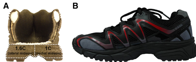
Figure 1 Variable stiffness shoe with the lateral midsole (1.6C) that is 1.6 times stiffer than the medial midsole (1C). (A) section view, (B) side view.

at the characteristic peaks during each dynamic exercise were obtained from the average curves. The average curves were graphed against the percentage stance in the walking case and graphed against time in other three exercises.