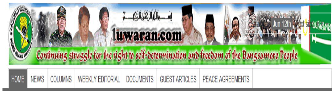
Figure 4.2. “History of MILF leadership”. MILF Luwaran’s banner

An MILF leader explained that this is an important strategy because while they are engaged in the peace process, which is an open engagement, they also conduct underground operations in the armed struggle with the government. In this sense, identifying all their leaders may be risky for their military operations in times of armed conflict. This also implies that despite the expectations that they can seal a workable peace agreement with the government, they continually suspect a movement towards war.