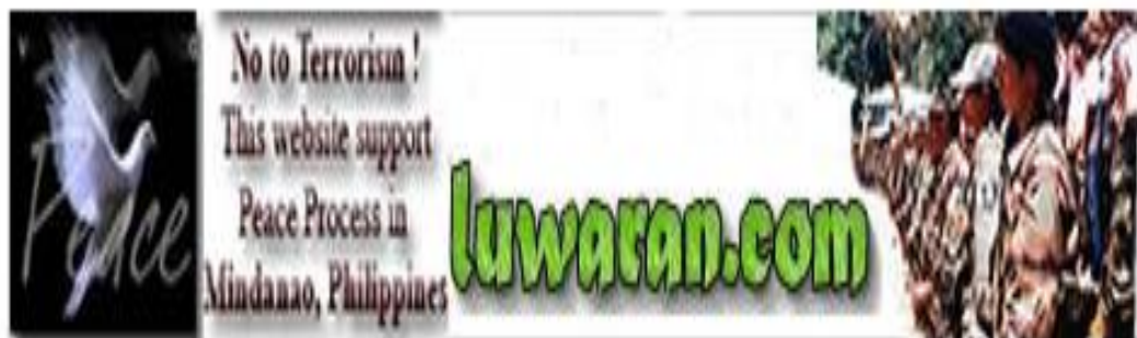
Figure 4.2. “No to Terrorism”.

With the prodding of its younger members, the MILF began to take on social networking. It runs two active Facebook Pages, Luwaran Marshland and Luwaran 47 , and a Twitter and MySpace page, which as of July 2011, have no content. According to the Web Team, being on Facebook is an advantage because they are able to see the opinion of younger members of the organization, “without having to answer for it”. They also argue that “this allows us to present the organization “soft and hard”, and explained that while they are often projected as violent, backward, and terrorist, they can also project themselves as “humans”, modern, and capable of articulating their struggle both in diplomatic and informal ways (MILF Web team, personal communication, May 2010).