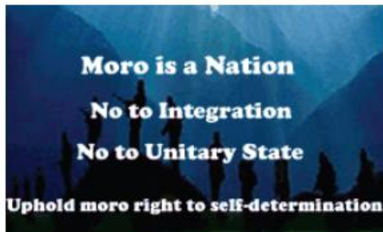
Figure 4.1. "Moro is a Nation".

slogan used to be placed at the Homepage, but is now embedded in the linked pages. The retention of the slogan, despite shifts in actual claims during political negotiations, highlights the organization's ultimate aim, which is to establish a state independent from the Philippine government. The possibility of presenting divergent messages is possible by embedding multiple articulations within the website.