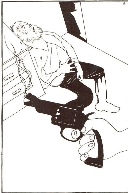
Figure 2: “Figlow Had Shot Him through the Heart” (Napper 664)

firing it at someone: the same kinds of impulse are at work, namely, a sort of “Point Blank Moralizing.”