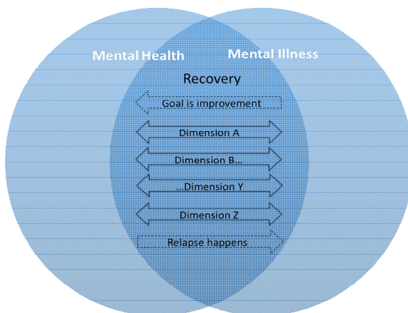
Figure 1. Recovery as a Nonlinear, Multidimensional a Process that Co-occurs with Mental Health and Illness

Keyes (2002) has demonstrated that symptoms of mental health have only a modest negative correlation with symptoms of mental illness. The work of Keyes and others makes a strong argument for why mental illness and mental health should be treated at separate constructs (Davidson 2003; Davidson and White 2007; Davidson et al. 2006).