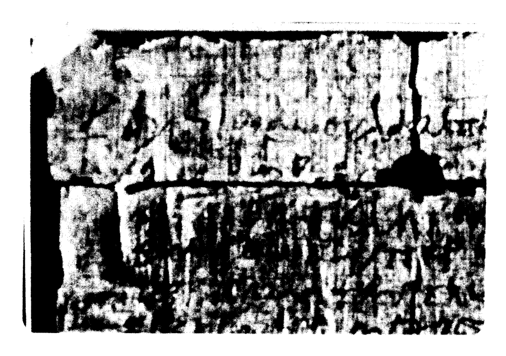
a) PSI 935 (enlarged detail, upper left)