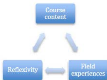
Figure 4. Academic Dimensions Mediating Candidates' Learning