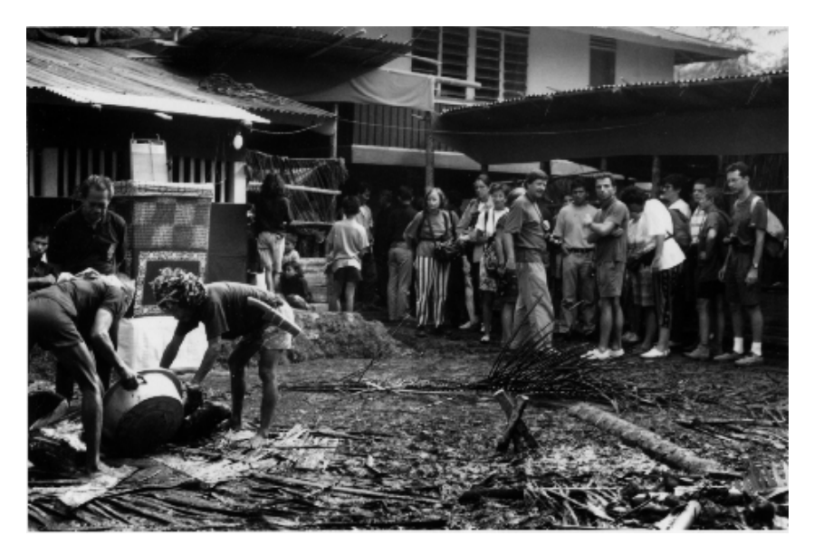
Figure 6.3. Tourists observe meat division at a Toraja funeral ritual.