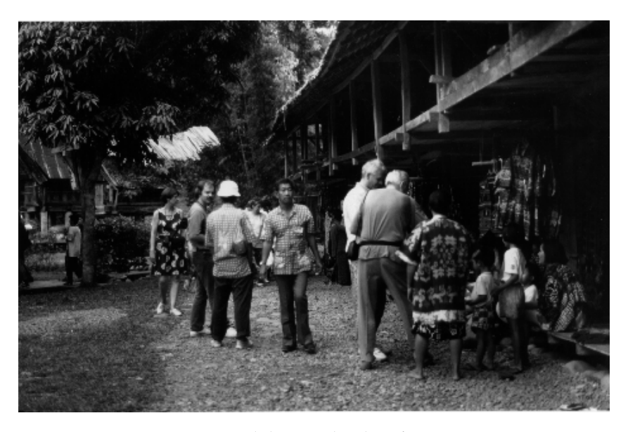
Figure 6.4. Western tourists and their guides shop for souvenirs at To Barana village, Tana Toraja, Indonesia.