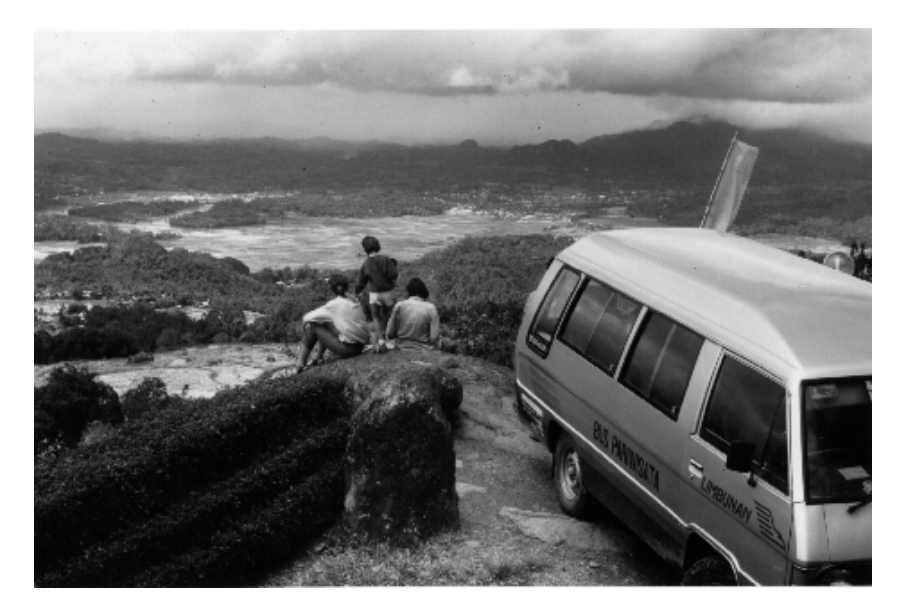
Figure 6.1. Western tourists pause to admire a panoramic view of the Rantepao Valley, Tan Toraja, Indonesia.