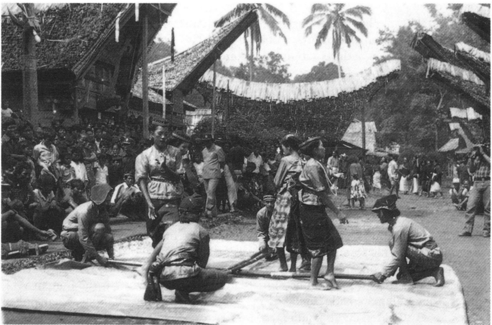
Plate 1. Dancers from central Sulawesi perform for the other guests and Ne Ke’te’s family. (Note in the far right corner the member of the documentation committee videoing this performance.)