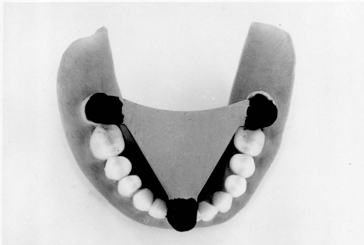
DENTURE WITH METAL PLATE ATTACHED