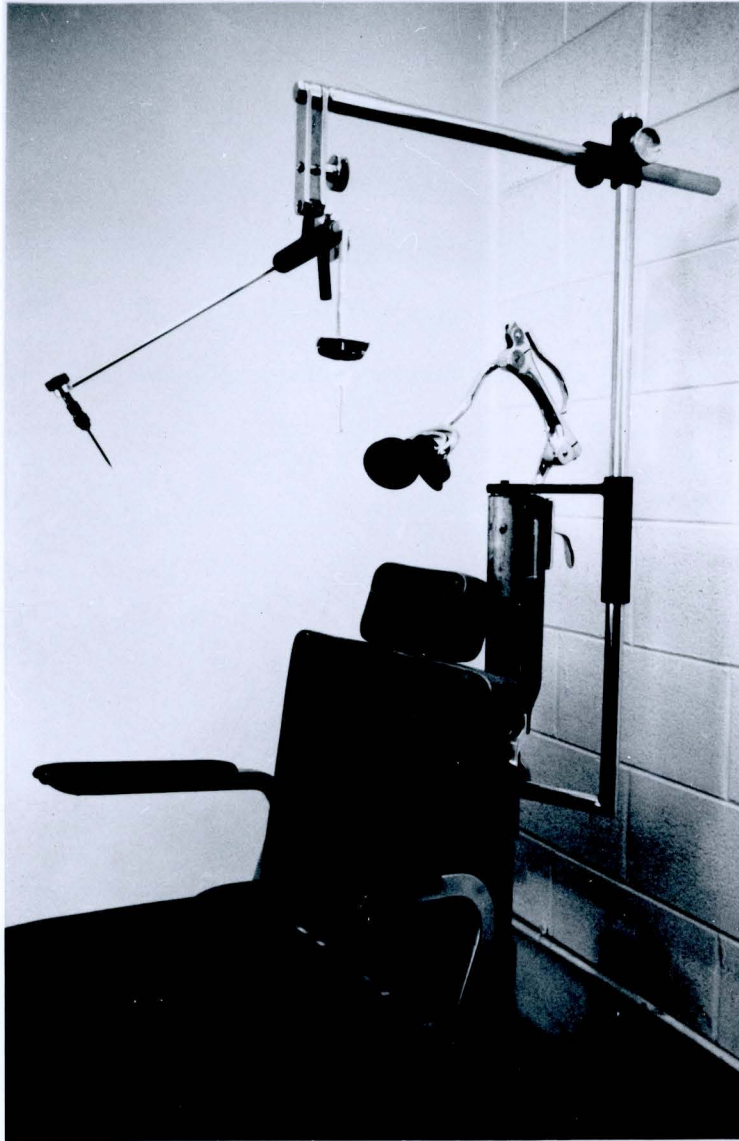
DENTAL CHAIR AND TORQUE WRENCH ASSEMBLY