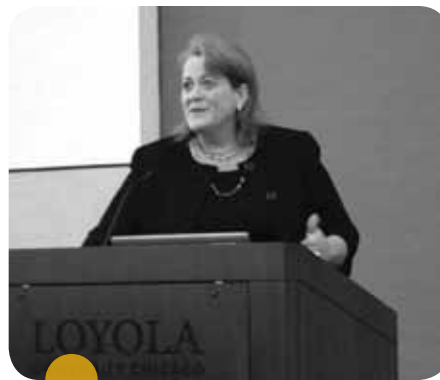
Honorable Virginia Kendall Judge, Northern District of Illinois

> Amend the Juvenile Justice and Delinquency Prevention Act to include the following provision: