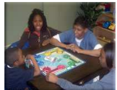
DWJS Bright Space Contact Visiting Room The first mother and child contact visiting space in the country that is located in a jail setting.

Therefore this project addresses a critical area where the criminal justice and community mental health fields intersect, and will further promote collaboration and access to the multiple services female detainees released from the jail need to succeed.