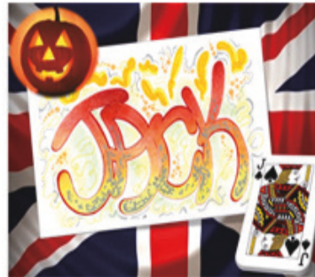
Figure 1. Jack on the Moodle platform

The first step consists in accounting for the etymological researches about the Germanic and French origins of the name Jack and the semantic extensions it has acquired being such a popular first name. In order to start exploring the innumerable uses of the word, the second activity exploits the Moodle tool Glossary to create a three pages combination of visual inputs with the main definitions of jack as a simple morpheme, or in compounded nouns (ex: jack-boots or yellow jack ) or in idiomatic/slang expressions (ex: with the meaning of “a five pound note” or even as a verb phrase to get jacked , meaning “to be punched, stolen or stabbed”).