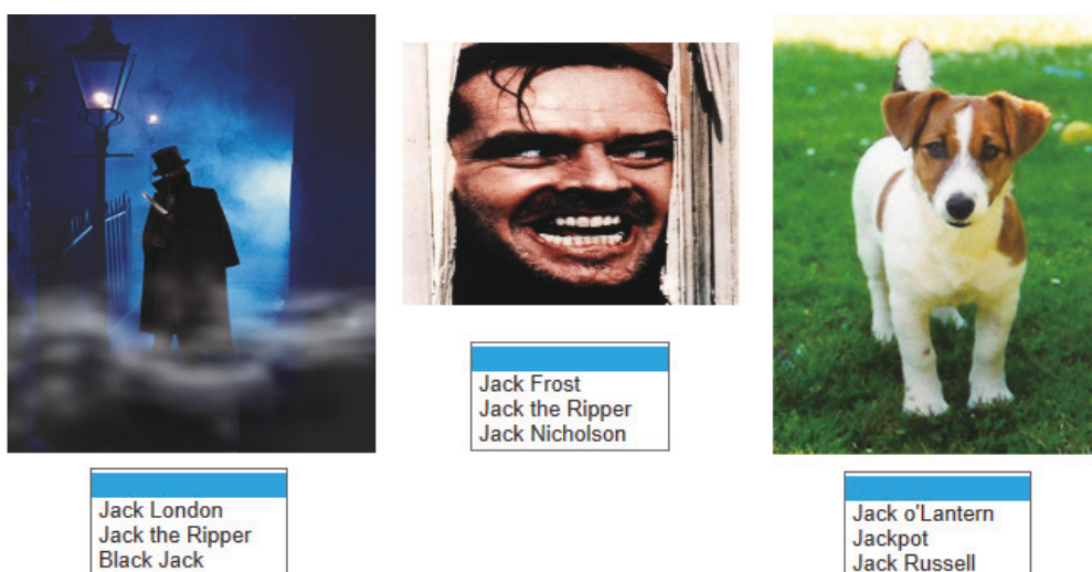
Figure 2. Various "Jacks" discovered through research

old-fashioned idioms or proverbs, like “ every Jack has his Jill ”, “ Jack of all trades and master of none ”, or “ to be a bit of a Jack the Lad ”; whereas Little Jack Horner opened up to a long list of proper names and surnames or nicknames, sometimes belonging to historical figures (from Jack London to Jack Nicholson, from Jack the Ripper to Jacko) sometimes to fictive characters (from Jack Sparrow to Jack Frost), sometimes indicating animal breeds (Jack Russell or Jackrabbit), brands (from Jack Daniel’s to Lumberjack) or folklore objects (Jack o’Lantern). Students attending my class enjoyed so much being engaged in a kind of guessing game which mixed randomly some of the Jacks already known to Italians with those they did not know and with other uses of the noun jack that they decided to turn it into a multiple choice quiz with pictures and quite ironical alternatives to be uploaded on the platform.