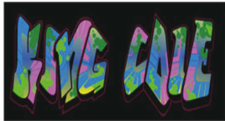
Figure 3. King Cole on the Moodle platform

This time the focus is mainly on the Nursery Rhyme about the semi-historical, semi-legendary figure of a pre-Arthurian king and on its generative power in modern times. Yet, as an introductory and motivational step, a matching activity (gapped text with multiple choice to be matched with images) has been devised to familiarize with the occasions when King Cole is used as a nickname or even as a proper name for a tea blend and a botanical species in modern times. One of the frames includes a short text on the original Old King Cole and serves as an introduction to the presentation of the actual Nursery Rhyme through a very classical subtitled video version with children dressed up in costume, playing and singing to it.