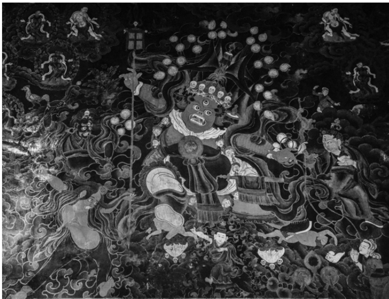
Figure 8. Mural of Dorjé Drakden with his own consort, minister, and emanation; Meru Nyingpa Assembly Hall, Lhasa.

This is the earliest known description of Dorjé Drakden, and it is from another text available in the Nechung Liturgy that was composed by the Fifth Dalai Lama's own student, the treasure-revealer Terdak Lingpa (Gter-bdag gling-pa 'Gyur-med