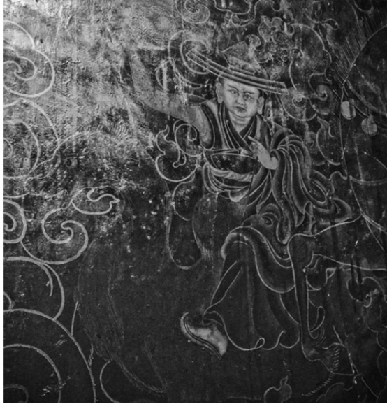
Figure 7. Mural of Dorjé Drakden as minister of Pehar's emanation, Kyechik Marpo; Meru Nyingpa (Rme-ru snying-pa) Assembly Hall, Lhasa.