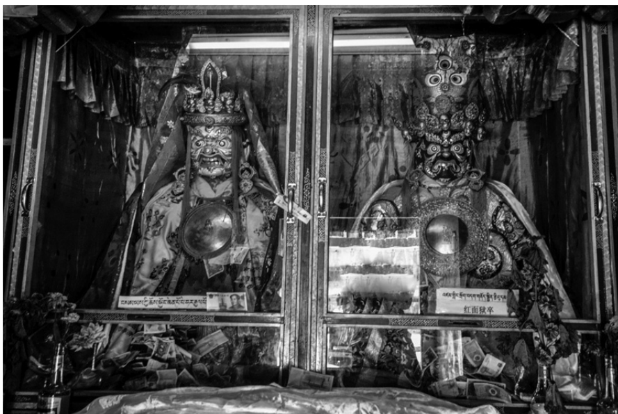
Figure 4. Statues of Pehar and Tsiu Marpo at Pehar Kordzöling ( pe-har dkor-mdzod gling ), Samyé Monastery.

One final observation about the Ten-Chapter Sādhana is that throughout these multiple editions, mantras are added and subtracted, and their spelling and pronunciations change. If the proper recitation of mantras is important to the successful completion of a ritual, 23 then these differences carry certain implications about the nature of error within Tibetan ritual architecture. Regardless, the Ten-Chapter Sādhana is representative of how treasure texts are not static texts but are always evolving in usage, significance, and even content well after they have been rediscovered.