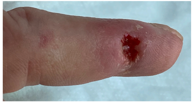
Fig. 2. Bleeding Ulcer after sharp debridement.