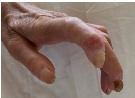
Fig. 6. Sclerodactyly and digital ulcer.