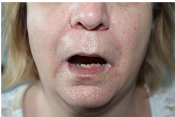
Fig. 7. Microstomia complicated by angular cheilitis.

daily activities of living (DAL) through 18 items. Each item can be scored 0–5: 0 corresponds to no difficulty at all, while 5 means patient's inability to complete the action. The final obtained score with this scale was proven to be a reliable and valid tool for SSc evaluation from clinical course, therapeutic intervention outcome, to analysis and prognosis evaluation [42]. Similarly, MHISS is a questionnaire where patients are asked to answer 12 questions investigating mouth involvement in SSc, giving a score from 0 to 4 to each of them [43]. Pain is commonly reported by SSc patients and it can be investigated through both unidimensional and multi-dimensional scales. The Visual Analog Scale (VAS)