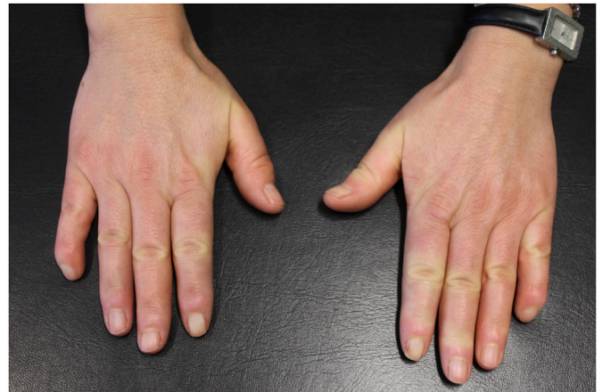
Fig. 4. Puffy hands.