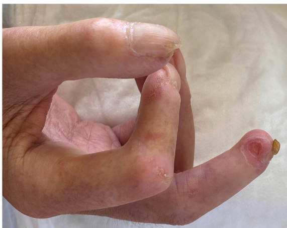
Fig. 5. Sclerodactyly and digital ulcer.