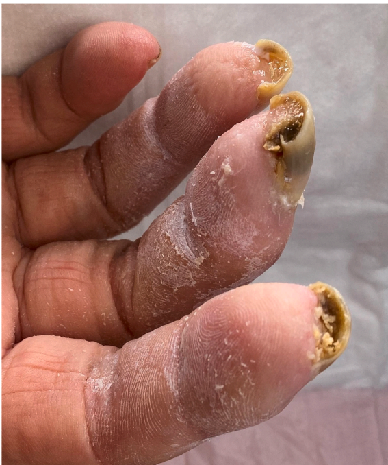
Fig. 1. Purulent exudate before sharp debridement.