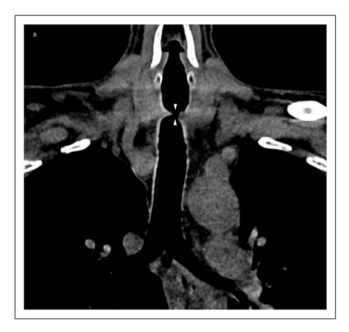
Figure 1. High-resolution CT scan of the chest: a coronal plane image passing through the tracheal lumen, showing severe stenosis of the lumen of the cervical portion of the trachea (opposing white arrowheads).

A 64-year-old man presented to the emergency department with dyspnoea on exertion and shortness of breath that started 2 months prior and progressively worsened. At admission, he had normal resting oxygen saturation and did not need immediate treatment or intubation. Six months prior, he had undergone mechanical ventilation via an orotracheal tube for the first week and then via a tracheotomy tube for the next 35 days for severe COVID-19 pneumonia. Lung CT scan showed no signs of pneumonia. High-resolution coronal CT scan of the chest (Figure 1) showed, passing through the tracheal lumen (white asterisks), severe stenosis of the lumen of the cervical portion of the trachea (opposing white arrowheads). Transoral flexible fibreoptic tracheobronchoscopy (Figure 2A) documents, just inferior to the vocal cords (black arrows) and the inferior border of the anterior arch of the cricoid cartilage (black arrowheads), tight concentric stenosis of the tracheal lumen (black asterisk). Residual respiratory patency (white opposing arrows), reduced to a small crack just in front of the posterior tracheal wall (grade III, Myer–Cotton classification), can be seen in detail in Figure 2B (opposing arrows). The patient underwent 'open field' tracheal resection