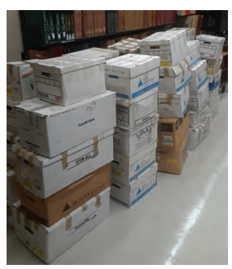
ABOVE: Record cartons from the permanent historical waiting to be shelved, RIGHT: Page from a roll of tribal members from 1898.

of genuine historical value might still be contained there. For this reason, members of the tribal nation will still need to comb through the temporary records to identify documents they might be legally obligated to keep but that would be closed to researchers, documents to be destroyed, and documents to be transferred to the