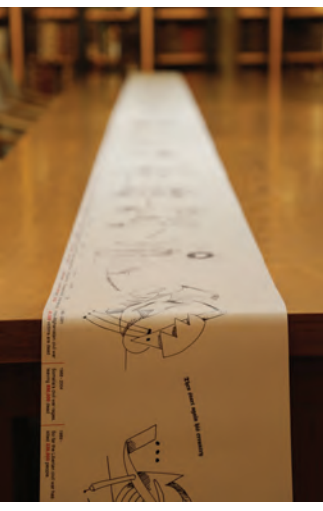
At 29 feet, the scroll is longer than the table in the Palmer Room