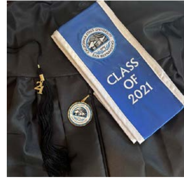
students are able to run for those roles within the clubs.

Leaders are made in the College environment and students have the ability to be leaders within the campus. Student leadership positions are everywhere from within the student body to the work environment on campus. Every club needs a leader and