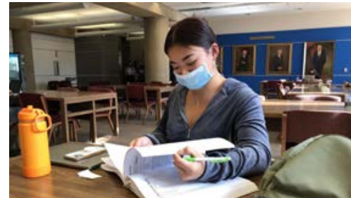
Story on page 5