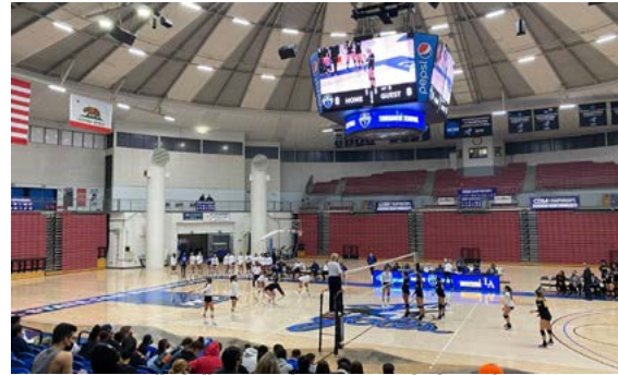
CSUSB Womens Volleyball versus Cal State Los Angeles by Jacob Cisneros