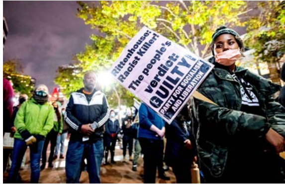
Demonstration in Oakland, CA following Rittenhouse's acquittal.