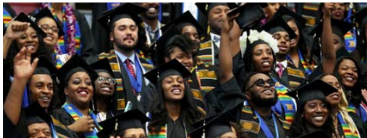
About 125 students were honored at the 25th annual Black Graduation held on June 2 by the CSUSB Black Faculty, Staff and Student Association at Coussoulis Arena.