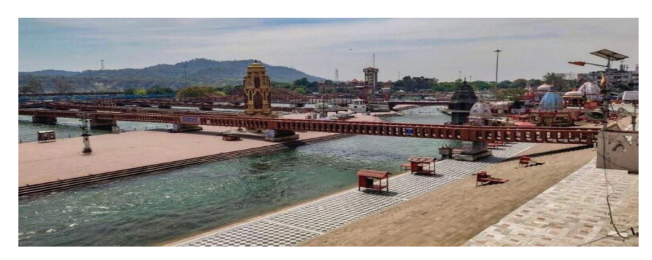
Figure 4: Representational Image.