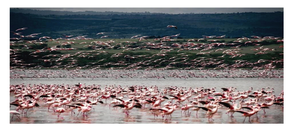
Figure 3: Representational Image.