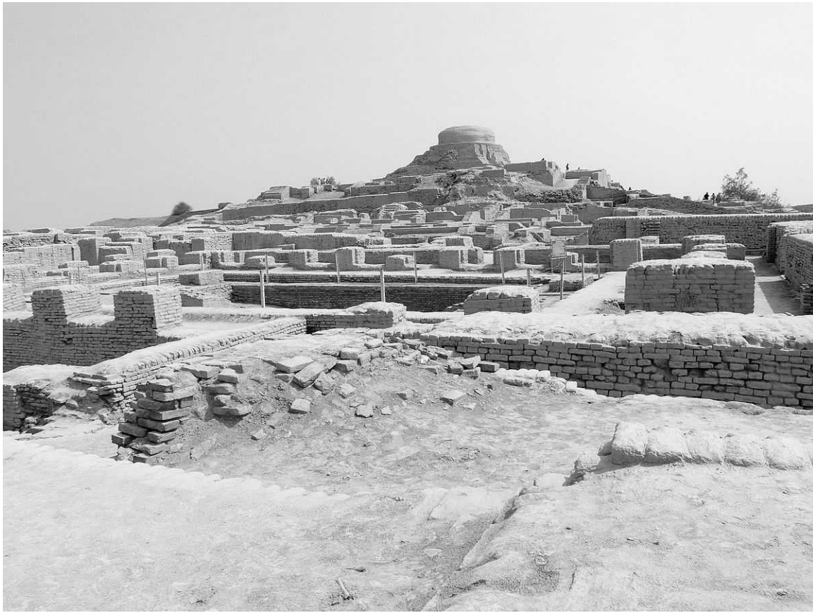
Figure 3. The mound, Moenjo Darro.