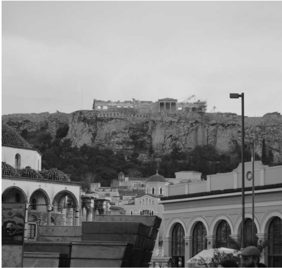
Figure 4. Acropolis View From Monastiraki Square, Athens , Greece