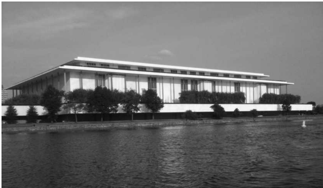
Figure 5: John F. Kennedy Center for the Performing Arts