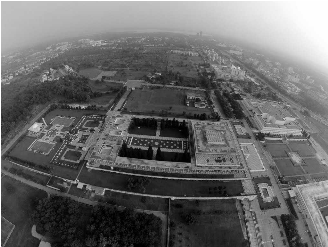
Figure 7. Drone Camera View Of The resident House, Islamabad.