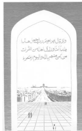
Figure 1b. Proposed Sketch of the Central Axis leading to Jinnah Tomb in Karachi - The first Federal Capital of Pakistan.