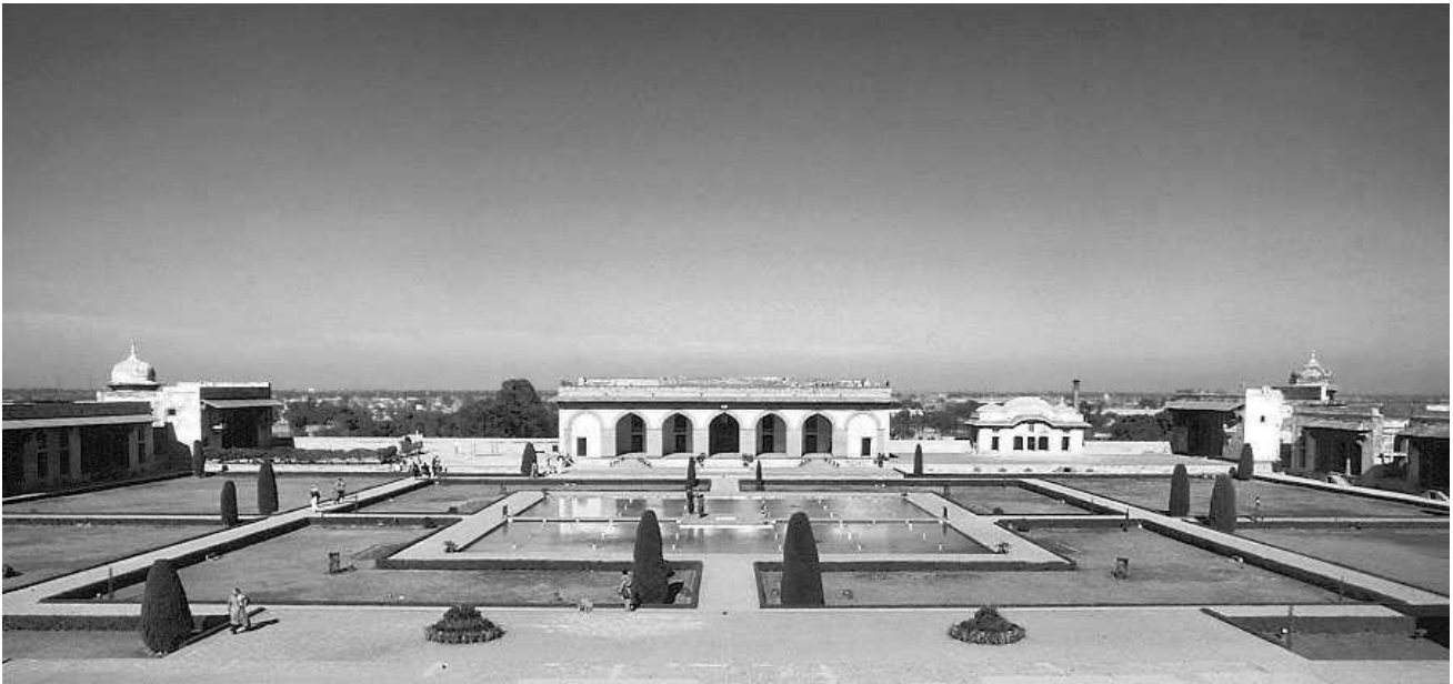
Figure 11. Jahangir's Quadrangle, Lahore Fort

Though, in contrast to its main function EDS treated the landscaping of this building just like Gardens of the great Mughals [26]. Prof. Leslie states while explaining the landscape that: