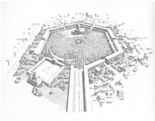
Figure 1a. Proposed Sketch for the Central Square in Karachi – The First Federal Capital of Pakistan.