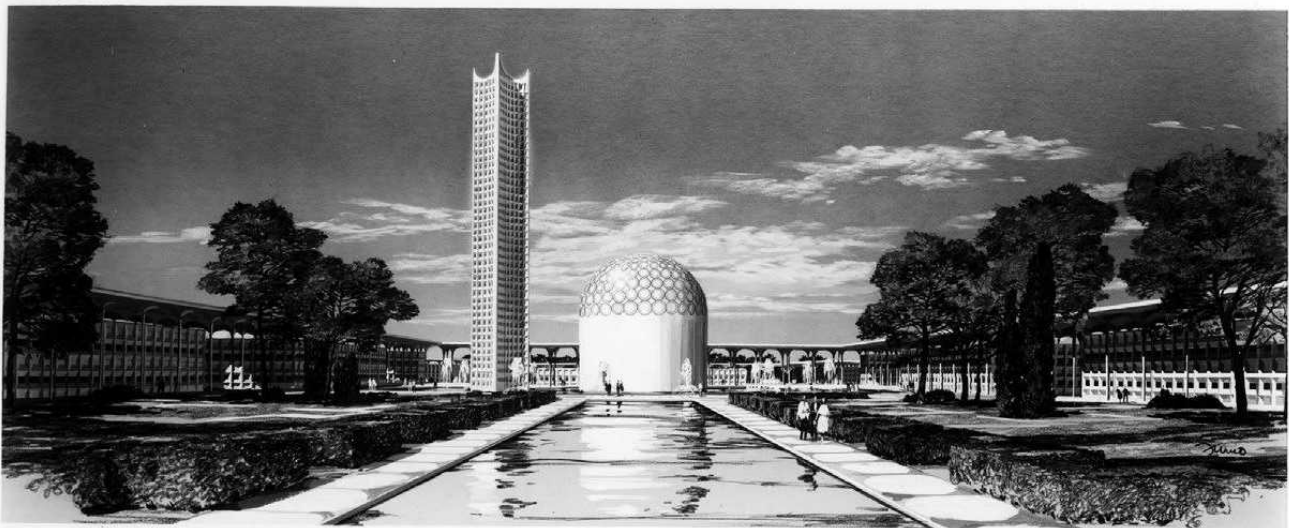
Figure 10. Artist Rendering of Pakistan Institute Of Nuclear Science And Technology