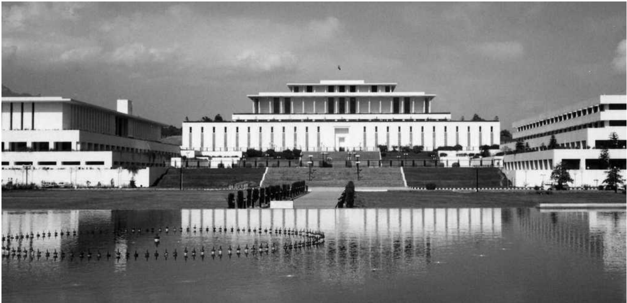
Figure 6. President House in Islamabad