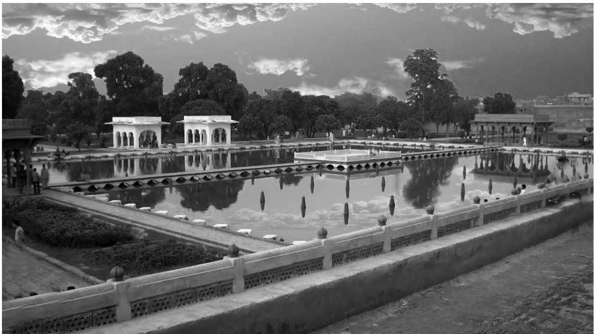
Figure 8. Shalimar Garden, Lahore