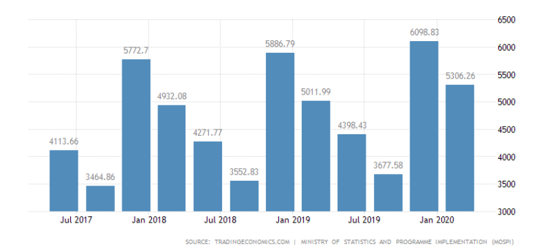
Figure 1: Contribution of Agricultural sector in India's GDP [2]

to country's GDP [1]. Fig. 1. is a chart signifying the importance of agriculture industry in Indian economy [2]. It shows year wise contribution of agriculture to country's GDP in Billion INR.