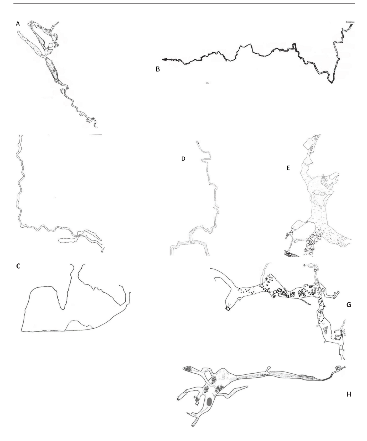
Figure 2: Studied caves. A.- Aguacachil, B.- Pozas Azules, C.- San Jeronimo, D.- Gabriel, E.- Los Riscos, F.- El Judío, G.- Coyozochico, H.- Karmidas.