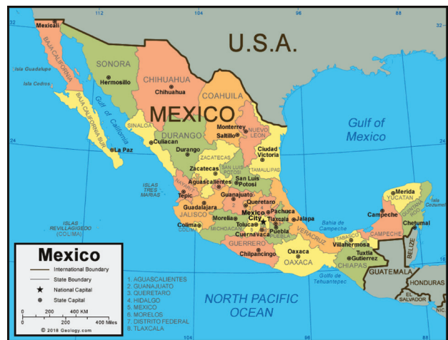
Figure 1: Geographical location of Mexican Republic

Mexican Republic (Figure 1) is located in the northern hemisphere, bordering the north with the US, to the south with Belize and Guatemala, West with the Pacific Ocean and east with the Atlantic Ocean. In the northern part of Mexico, the territory reaches 32° 43' 06", North latitude and 114° 45' West Longitude, in the state of Baja California, which constitutes its northernmost tip and in the southern part of Mexico, its territory reaches 14° 32' 27" North latitude and 92° 13' 0" Longitude West, in the state of Chiapas, which constitutes its southernmost tip. Mexico is divided into 31 states and Mexico City is its capital, its area is 1,964,375 km 2 with a population of 127,000,000 million inhabitants, [18] Instituto Nacional de Estadística y Geografía (INEGI).