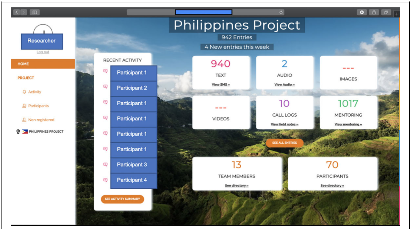
Figure 1. The on-screen layout of On Our Radar platform. Names of the researchers and participants were concealed.