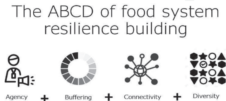
Figure 3. The ABCD of food system resilience building.

Human agency is a key factor in determining how individuals and society respond to change, disruptions and crises. Agency can be understood as the ability of people to choose their actions and execute them as they see fit. By emphasising agency, we go beyond the view of vulnerable people as passive victims in the face of external threats or crises. Agency is strongly related to adaptive capacity: the necessary resources for people and systems to adapt and learn, but agency also allows for anticipation and prevention. So far, discussions on food system