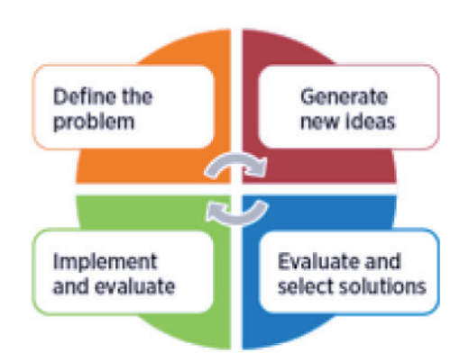
Figure 1. Problem-solving logic [1].

This course starts with a discussion about mental models and how their impact in the understanding of the reality. In this specific context, helps to realize why we all disagree about problems or circumstance and facilitate the communication and agreements [7].