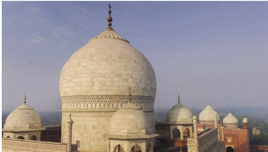
Figure 1. Photograph of the central dome of the Taj Mahal showing the supporting drum.