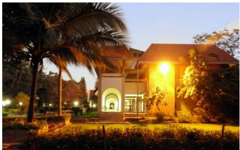
NIAS in the Evening

NIAS celebrates its Foundation Day on 20 June.