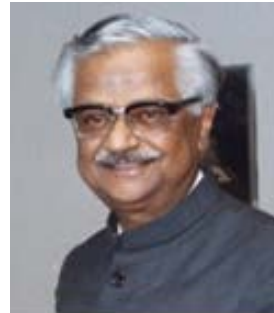
Founder Director RAJA RAMANNA

The National Institute of Advanced Studies (NIAS) was conceived and established by the vision and initiative of the late Mr. J. R. D. Tata. Dr. Raja Ramanna, as the Founder Director, immensely