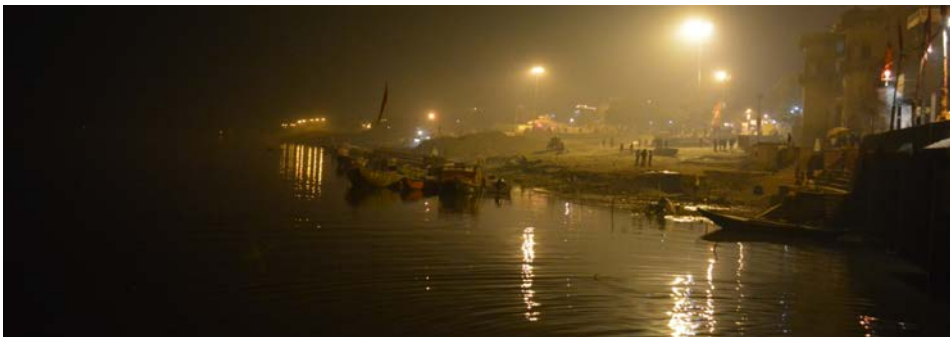
Ganga: Photograph by Sangeetha Menon