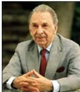
Founder Chairman JRD TATA

The National Institute of Advanced Studies (NIAS) was conceived and established by the vision and initiative of the late Mr. J. R. D. Tata. Dr. Raja Ramanna, as the Founder Director, immensely