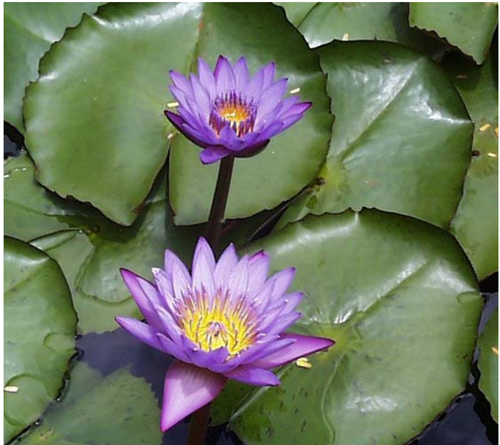
From the NIAS Lily Pond – Photo courtesy: Sangeetha Menon

Stay in Touch! See us at: www.nias.res.in