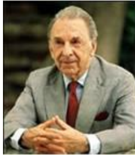
Founder Chairman JRD TATA

The National Institute of Advanced Studies (NIAS) was conceived and established by the vision and initiative of the late Mr. J. R. D. Tata. Dr. Raja Ramanna, as the Founder Director, immensely