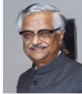
Founder Director RAJA RAMANNA

The National Institute of Advanced Studies (NIAS) was conceived and established by the vision and initiative of the late Mr. J. R. D. Tata. Dr. Raja Ramanna, as the Founder Director, immensely