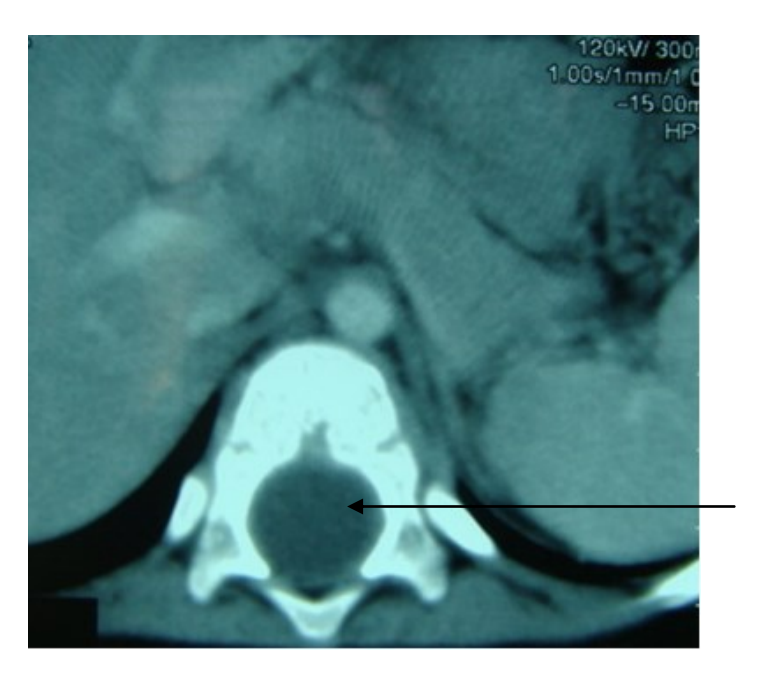
Figure 1: Axial CT scan at the level of the lesion shows widening of the spinal canal and hypodense expansion of the cord, outline of the lesion couldn't demarcated (arrow).