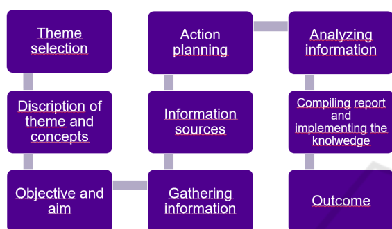
Figure 2: Proposed approach for public sector benchmarking.

objectives, their networks and methods are quite same. Similarly, the concrete operation in these cities proved to be much the same. There is no one organized way of how the benchmarking is to be conducted. From the knowledge management practises there is the gathering of the data, sometimes referred to as empirical material, and the organizing thereof (Choo, 2002; Hellsten and Myllärniemi, 2019). Each area may have a different way of doing this, even inside of one city. The systematic way, or a model, is not there. We offer a possible approach for the future benchmarking activities (Figure 2.).