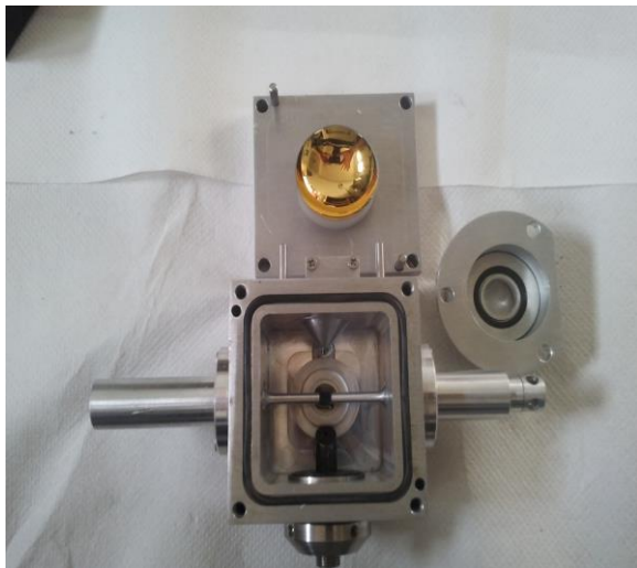
Figure 1: MicroMED Breadboard.

the instrument. This is related to grain size via scattering models. The run duration has been tuned in order to acquire about 400-2000 particles depending on dust concentration. This will allow to obtain enough statistics to sample the dust size distribution. The system has been designed in order to work up to particle concentrations of several hundreds \text{cm}^{-3} before coincidence effects become significant. The estimated fraction of coincidences goes from 0.01% (constant haze) to < 4\% (dust devil).