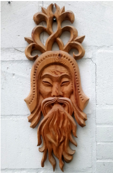
Fig. 7. The Covid-19 virus as evil spirit. Humorous Chinese mask, initially marketed for Halloween 2020 but later withdrawn from sale by Amazon as being in bad taste.