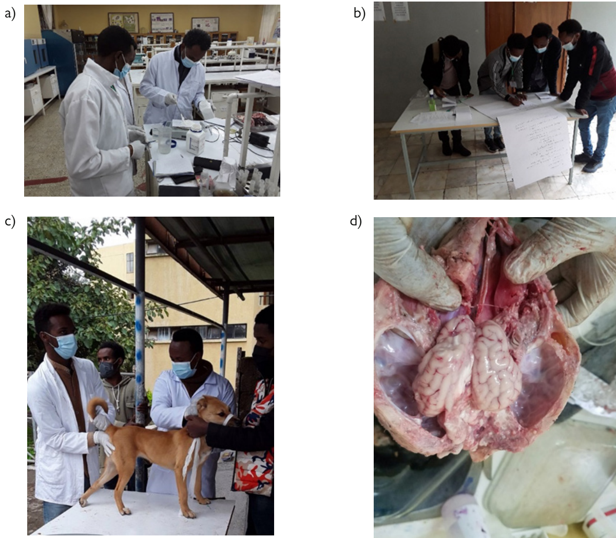
Fig. a) Trainees practicing laboratory part of the training; b) The group assignment for the presentation; c) Trainees practicing the faecal sample collection from the dogs; d) Examining the sheep head for Coenurus cerebralis .